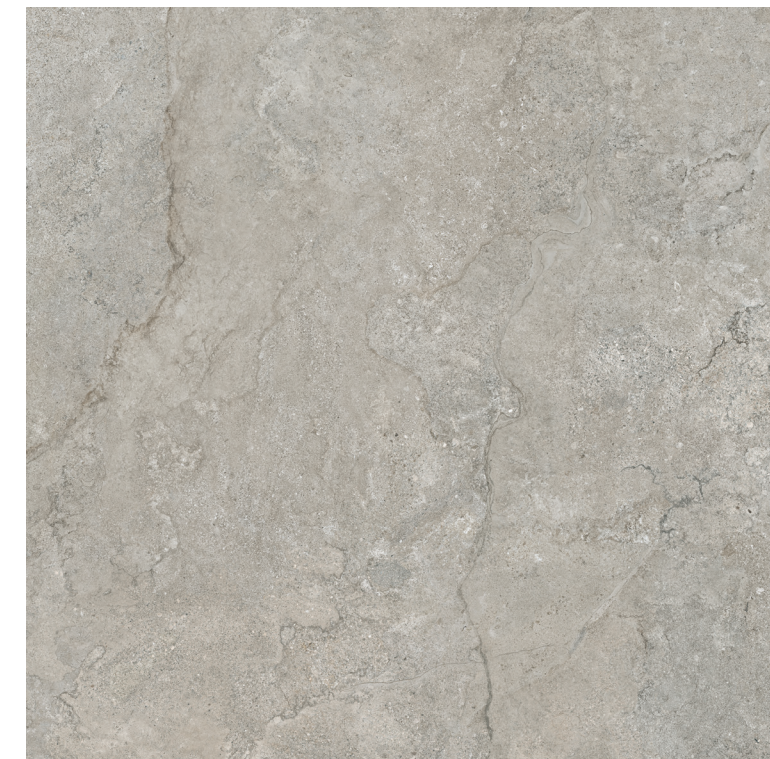
S-Tech Gobi Natural 100x100 R