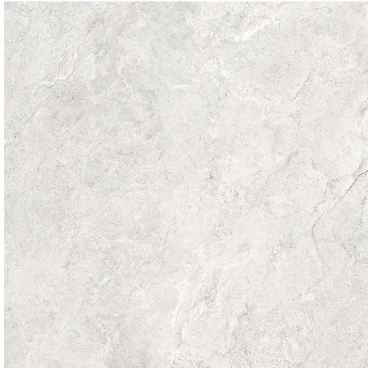
S-Tech Gobi Pearl 100x100 R