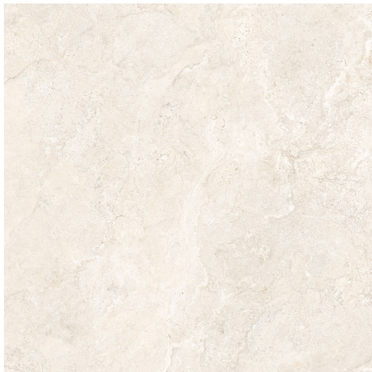
S-Tech Gobi Ivory 100x100 R