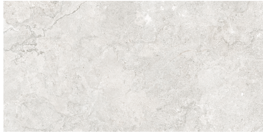
S-Tech Gobi Pearl 60x120 R