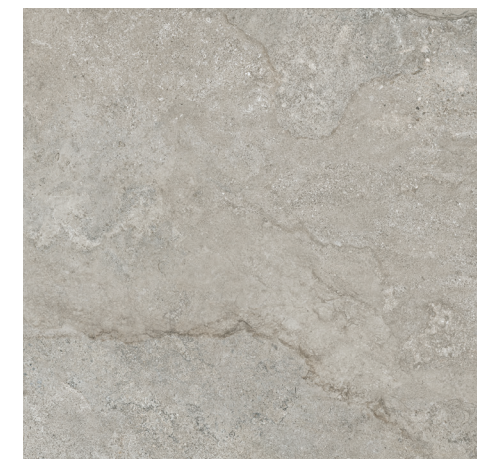
S-Tech Gobi Natural 60x60 R ST331R