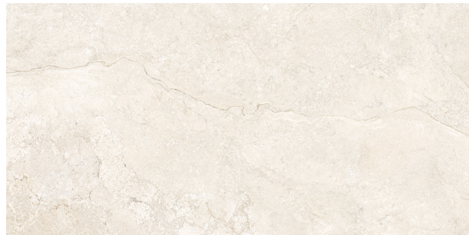
S-Tech Gobi Ivory 60x120 R