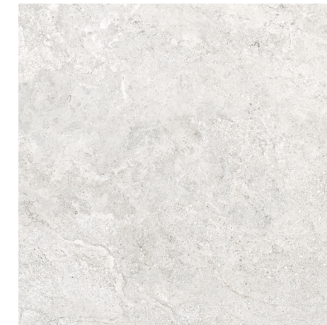
S-Tech Gobi Pearl 60x60 R ST331R