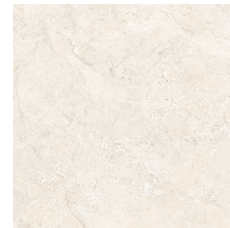
S-Tech Gobi Ivory 60x60 R ST331R