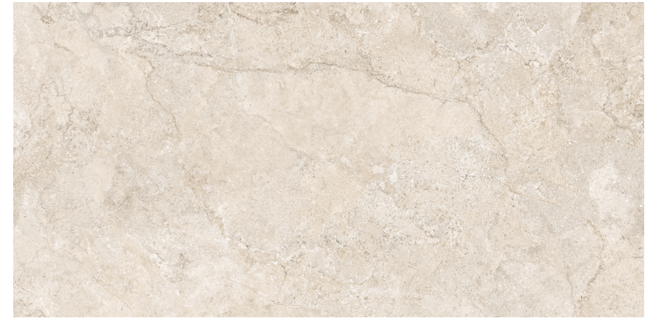
S-Tech Gobi Cream 60x120 R