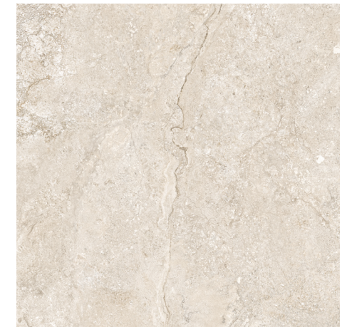
S-Tech Gobi Cream 60x60 R ST331R