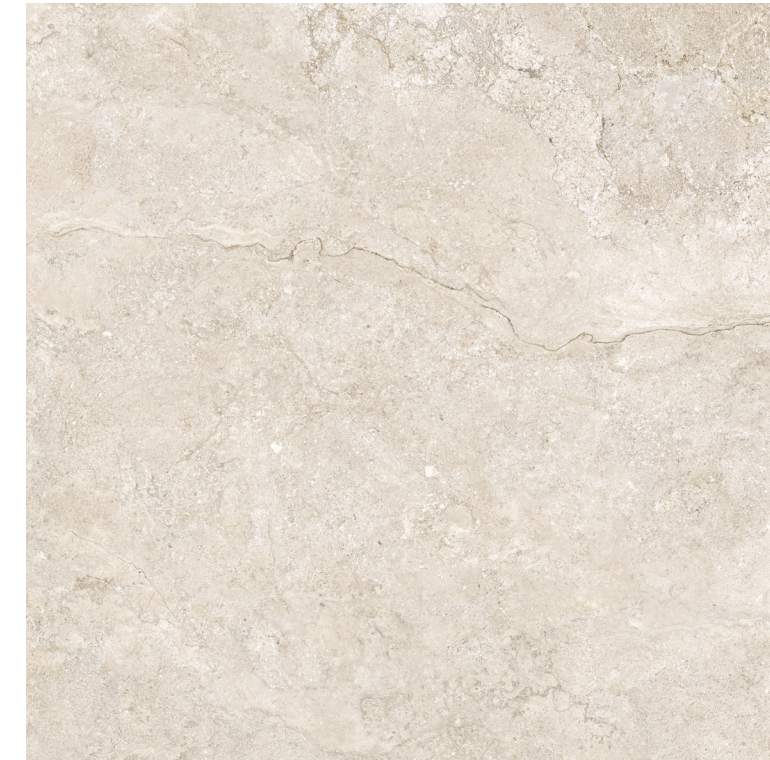
S-Tech Gobi Cream 100x100 R