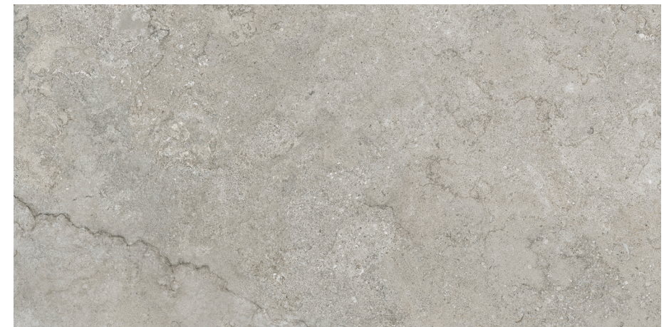
S-Tech Gobi Natural 60x120 R